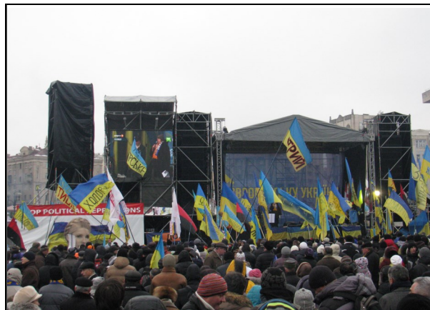
Mr. Goldring spoke on the stage to 400,000 people with a message of support "this day and always" to democratically and peacefully put forth your demands that your desired destiny be fulfilled.

encouragement. When I was leaving the stage they chanted over and over again, many times, the words that I was told were: