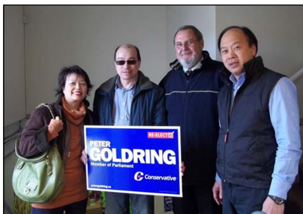
Support from Edmonton East’s different ethnic communities was a key factor in the re-election of Member of Parliament Peter Goldring

In Edmonton East the Liberal vote dropped again, even with the national Liberal campaign's attempts to rebuild. In fact, in spite of running a very good, highly visible campaign, Shafik Ruda’s vote percentage at 7% was one of the lowest Liberal percentages in Edmonton, second only to the Liberal in