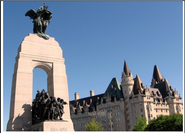
Ride 2 Remember participants will pass by Canada’s National War Memorial after the ceremony on Parliament Hill.

riders coming from the USA, Canada, Australia and Israel), but for 2012 the ride is being opened up to non-Jewish motorcycle clubs who want to participate, including the continent-wide Christian motorcycle group Mission of Hope (M25) who want to join in the R2R in recognition of the Holocaust and other world genocides such as the Holodomor in Ukraine. The Perfect Pigs MC who organize