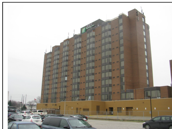
The Holiday Inn and Suites Hotel in Markham, Ontario where the JMA will host a weekend of R2R activities, including a special banquet and a Ride through Toronto.

Many of those making the ride are concerned that the lessons of the 10 million lives lost in the Holocaust, and 10 million more lost in Stalin's forced famine (Holodomor) in Ukraine, have not been learned in the years since. Unfortunately man's inhumanity to man has been manifest many times in the past century, a century so violent that man-