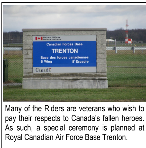
Many of the Riders are veterans who wish to pay their respects to Canada's fallen heroes. As such, a special ceremony is planned at Royal Canadian Air Force Base Trenton.

From Washington DC, the Maccabees will escort the Christian Riders and other prominent Americans for the Ride to Canada. It is expected that the riders will be given a police escort when they cross the Canadian border that will stay with them until they reach their final destination in Toronto.